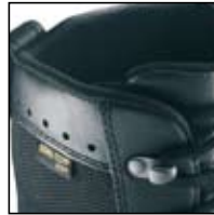
HIGH QUALITY MATERIALS